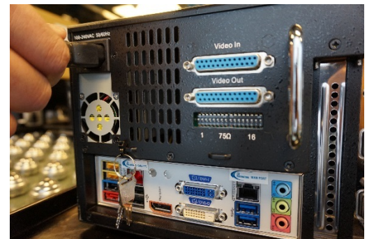
DB25 to BNC connections (Video In/Video Out). This unit type is not eligible for FL-TF.