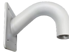
DB61 (Wallmount Goose neck)