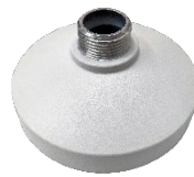
B5 (Pendant mounting bracket)

DB60CPM – Corner/pole mount bracket, use with DB61