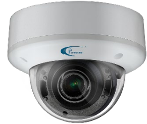
Am53, 2MP HD-analog camera

Am53 is compatible with i3's line of HR16/HR16v2 encoders and Veo16p Embedded HVR servers.