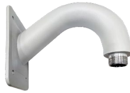
DB60 (Wallmount Goose neck)

Live Chat: http://i3chat.i3international.com/chat