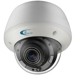
Am73, 5MP HD-analog camera

Am73 is compatible with i3's line of HR16 encoders and Veo16p Embedded HVR servers.