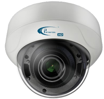
Am51, 2MP HD-analog camera

HD analog cameras are designed to use existing coaxial cable infrastructure which allows for longer cable distances, while providing an exceptional HD image, comparable to megapixel IP cameras. Am51 offers 1080P resolution and supports all three main HD analog formats: TVI, AHD and CVI. Am51 is fully compatible with i3's line of HR16 encoders.